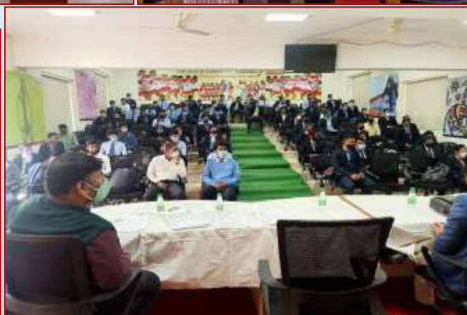
Glimpses of campus placement process of Extramarks at ICFAI University Jharkhand