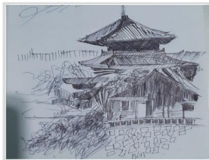
Arpita Shree BBA LLB IIII