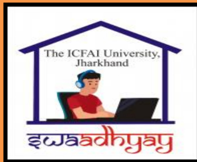
Details of contents uploaded in Swaadhyay portal

ICFAI University Jharkhand launches SWAADHYAY-II, advanced version of its Digital Education Platform to provide better quality of Education with a focus on Outcomes based education, more Interesting Classes using Digital Education Tools, like Polling, Quiz program, Group Discussions etc. and Virtual Labs.