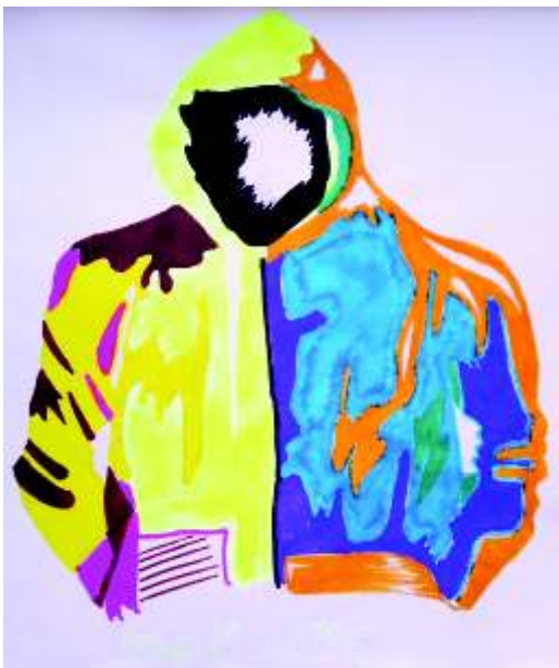
Sonu Nigam BCA Sem III